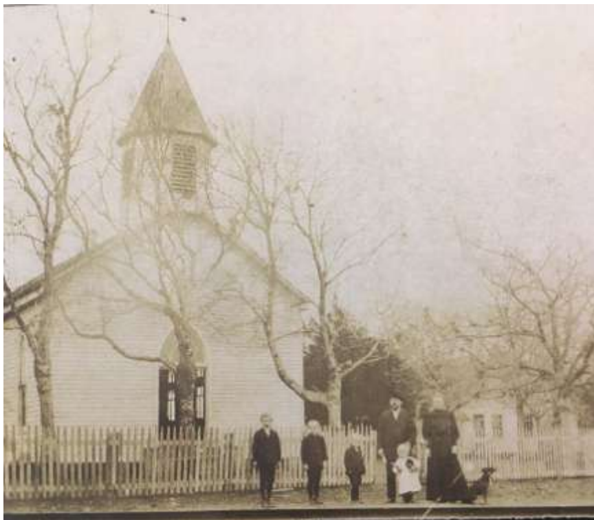
A few photos across the decades from the St James archives