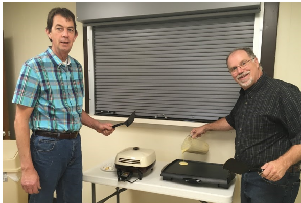
↑ Scenes from St. Paul's Pancake Feast!