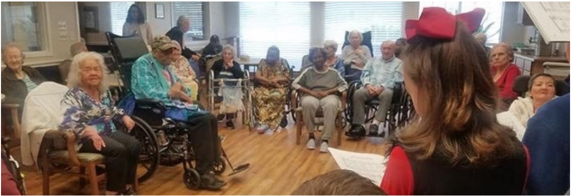
The St James Sunday School families sang carols on December 8 at Brenham Nursing and Rehab as well as Kruse Village.