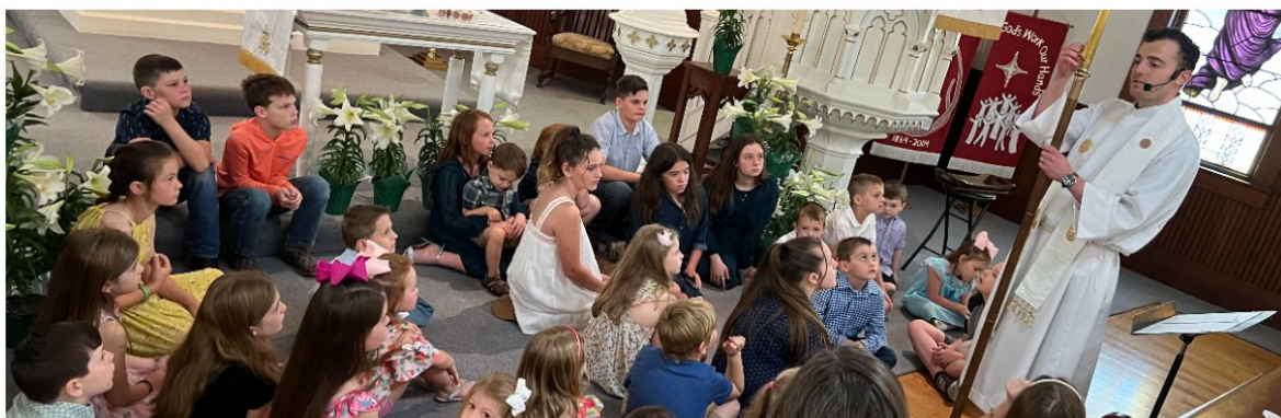
Top photo—St Paul Egg Hunt